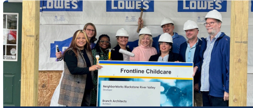
May 6 | NeighborWorks Blackstone River Valley broke ground on its Frontline Childcare and Public Service Worker Residence in Woonsocket