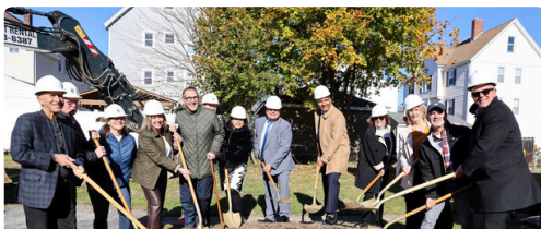
Nov. 4 | Foster Forward broke ground on Melrose II, a sustainably designed affordable housing project in Pawtucket,