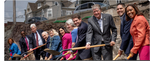
May 30 | One Neighborhood Builders hosted a groundbreaking to celebrate the start of construction of Broad Street Homes, 46 units of housing in Central Falls