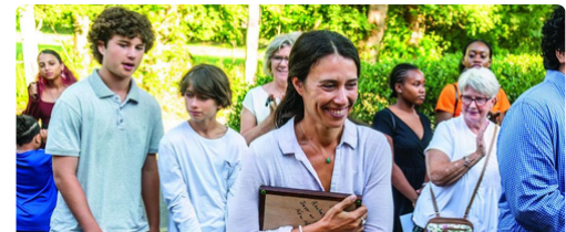
July 23 | South County Habitat for Humanity hosts a home dedication ceremony at the Old North Road in Kingston