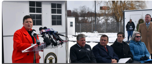
Feb. 11 | House of Hope CDC opened ECHO Village, a first-of-its-kind temporary shelter project