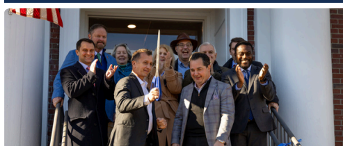
Dec. 5 | Valley Affordable Housing hosts a ribbon cutting at the Lonsdale Memorial Lofts in Lincoln