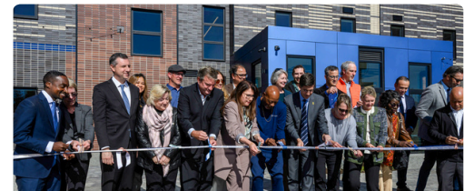
Oct. 10 | Crossroads RI cut the ribbon on Summer Street, the largest permanent supportive housing development in New England