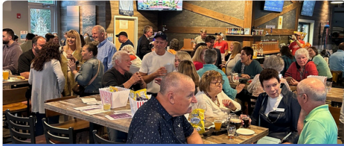
April 24 | South County Habitat for Humanity celebrates its 35th anniversary with a "Hammer & Ales" event