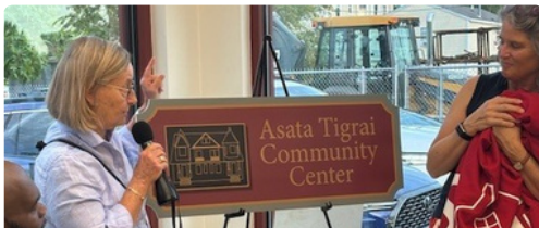
Sept. 16 | SWAP dedicated a new Asata Tigrai community center in Providence