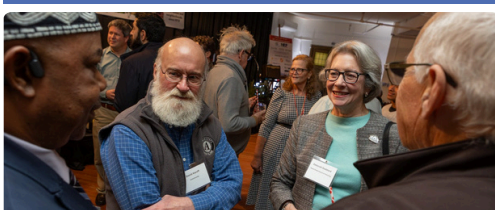
Nov. 19 | SWAP celebrates its 50 th Anniversary