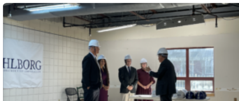
Nov. 4 | The Housing Authority of Newport broke ground on renovations to Florence Gray Community Learning Center