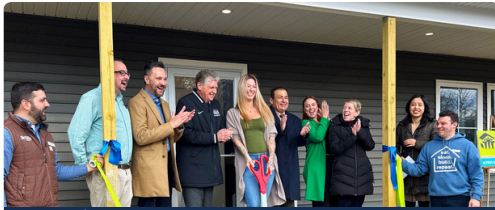
Jan. 24 | South County Habitat for Humanity hosted a home dedication ceremony at Cardinal Lane in Hopkinton (four new, net-zero, single-family homes)