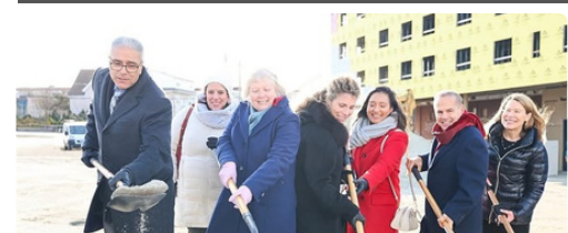
Dec. 8 | City Center groundbreaking ceremony hosted by One Neighborhood Builders, Foster Forward, Crossroads and Family Service of Rhode Island