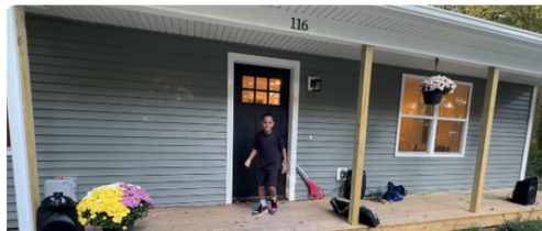
Oct. 1 | South County Habitat for Humanity hosted a home dedication at Lewis Lane in Wakefield