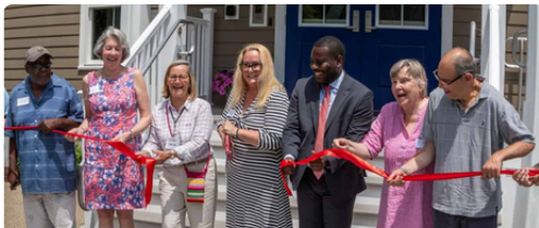
June 23 | SWAP and Looking Upwards cut the ribbon at Hammett Court in Jamestown, providing 12 affordable and accessible apartments