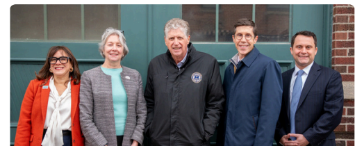
Nov. 13 | Providence Revolving Fund and partners launch R.I.'s new Statewide Home Repair Program