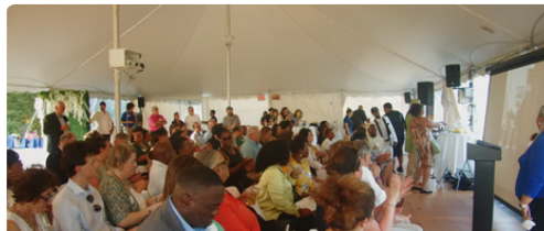
July 17 | West Elmwood Housing Development Corp. celebrates 55 years