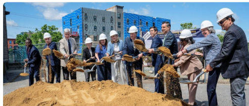
June 2 | Crossroads RI broke ground on Health & Housing Apartments (35 permanent supportive apartments for medically vulnerable adults experiencing homelessness)