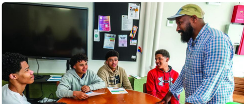
May 31 | The Jonnycake Center for Hope officially opened its new youth center