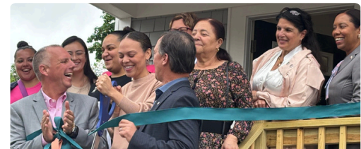
June 17 | PCF Development hosted a ribbon cutting at 125 Young Street in Pawtucket