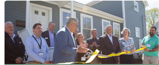
April 23 | SWAP celebrated a ribbon cutting of three new single-family homes in East Providence